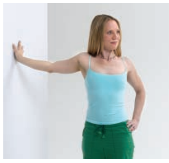
USE A WALL to stretch fascia and deep muscle tissue.